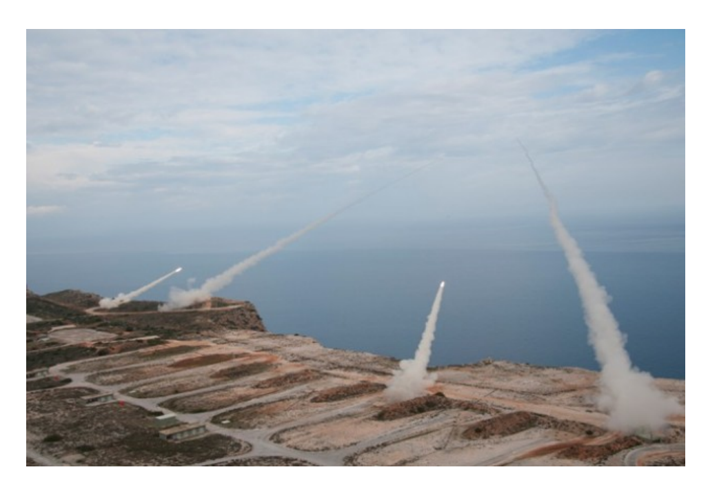
The Hellenic Army conducting Multiple Launch Rocket System firings at NAMFI.

The only place in Europe where missiles can be test fired is the NATO Missile Firing Installation (NAMFI), <sup>26</sup> one of the few ranges on earth that can host almost every type of activity on the ground, surface and air. NAMFI can host ground-to-air, ground-to-surface, surface-to-surface, air-to-surface, and torpedo firings along with experimental firing activities, joint live fire exercises, certifications of airborne and seaborne target drones, and personnel and units. Six airborne targets can be used simultaneously to practice for complex threats, good weather conditions allow for year-round operations, and the orientation and size of the facility allows for the maximum range of weapon systems. The Hellenic Air Force wing and NMIOTC are located close by, allowing troops returning from war zones or participating in NATO operations to combine multidimensional exercises with missile firing practice. NAMFI has served over 400,000 trainees and more than 70,000 visitors.