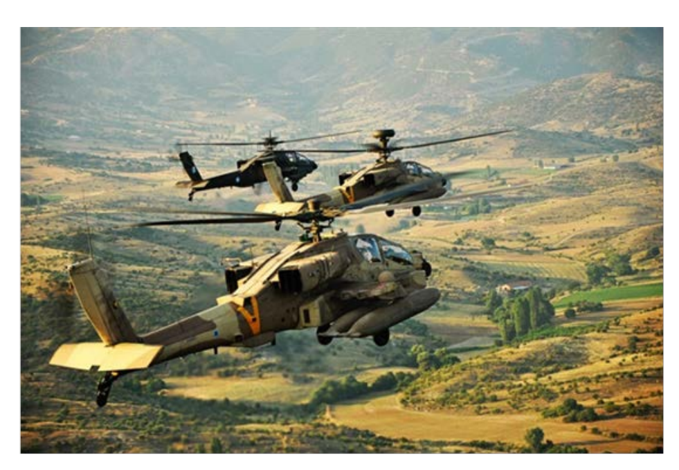
Israeli and Hellenic Apache helicopters fly together in a joint aerial exercise -- such drills are central to their military cooperation.

In 2014, Greek, American, European, and North African naval forces participated in the eighth Phoenix Express exercise to increase maritime safety and security in the Mediterranean Sea. That same year, the Hellenic Navy and Air Force and the Standing NATO Mine Countermeasures Group Two conducted a national exercise to upgrade operational cooperation of naval and air units, the U.S. and Hellenic Air Forces participated in NATO training at the Souda Bay air base to share tactics and procedures, and the Hellenic Navy and the Royal Task Force conducted Cougar 2014 in the Ionian Sea to practice technical exercises.