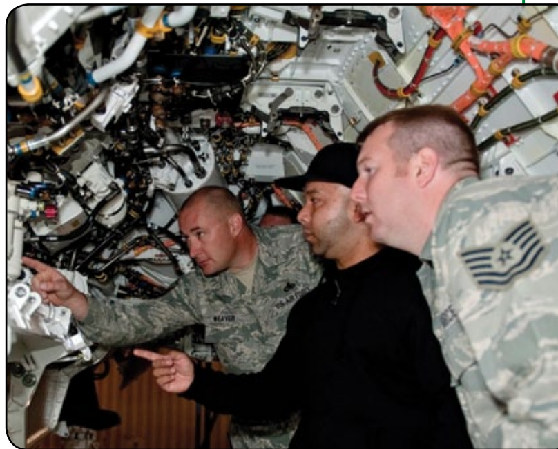
^ Maintenance on the inside of the internal weapons bay of an F-35C Lightning II at Naval Air Station Patuxent River.

The prospect of sequestration has motivated a search by some in Congress and the Executive Branch to identify alternative cost cutting approaches that would provide significant savings from the defense budget without requiring draconian cuts to programs and personnel. Some observers have suggested that Congress doesn’t need to find all $500 billion this year to avoid sequestration. It only needs to find $40 billion to $50 billion to postpone further cuts. 12