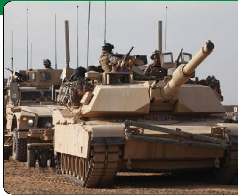
^ One example of successful Performance-Based Logistics is the M-1 Abrams tank.

Efficient supply chains are critical to the U.S. military both to support the warfighter but also to manage the cost of defense. Good supply chain management reduces costs by limiting inventories of spare parts, increasing the flow of MRO work and sustaining high availability rates for platforms and systems.