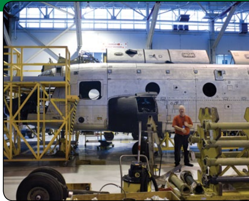
^ CH-47 Chinook maintenance at the Corpus Christi Army Depot – just one of many military depots and logistics centers located around the country.

In addition, the organic industrial base is protected by federal laws that unfairly skew business case analyses in its favor. For example, 10 U.S.C. 2461 states that “no function of the Department of Defense performed by Department of Defense civilian employees may be converted, in whole or in part, to performance by a contractor unless the conversion is based on the results of a public-private competition.” The law appears to explicitly acknowledge a private sector cost advantage insofar as it mandates that no work performed by government workers be outsourced to the private sector unless the estimate of savings to be realized is equal to or exceeds the lesser of: a) 10 percent of total value or b) $10 million. 34