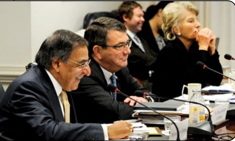
^ Secretary of Defense Leon Panetta and then-Under Secretary of Defense for Acquisition, Technology and Logistics, Ashton Carter, at a defense briefing.

The Obama Administration entered office with a reform plan focused in large part on solving the problem of escalating costs in major defense programs. In 2009, Congress passed the Weapon Systems Acquisition Reform Act (WSARA) intended to improve the oversight and management of major defense acquisition programs. WSARA's primary focus was on exerting better oversight through the creation of new senior management positions, adding administrative activities and increasing reporting requirements. The hope was that by more tightly controlling the requirements process, the selection of technologies, the expenditure of funds, the development of products and the testing of new platforms and capabilities, costs could be reduced and the chances of a successful outcome increased. 5