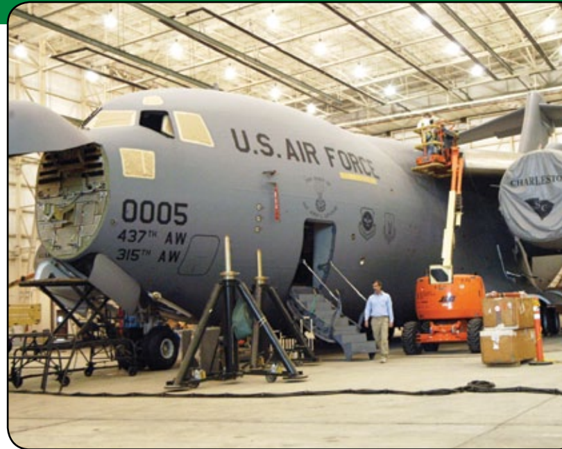
^ A C-17 undergoing maintenance at Robins Air Force Base.

External pressures on the defense budget are only one part of the problem. There are also internal pressures and issues that combine to challenge the ability of the Department of Defense (DoD) to effectively manage the resources provided so as to produce the most cost-effective defense posture. The growing cost of must-pay personnel bills such as military health care, retirement pay and other benefits