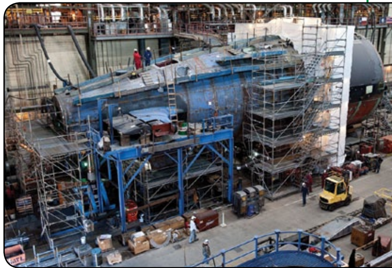
^ Construction of Virginia-class nuclear submarine.

Poor cost data and incomplete analysis make it difficult to conduct credible business case analyses or to accurately assess potential costs and savings associated with decisions to insource or outsource logistics and sustainment work. In view of the growing body of evidence that public sector employees are significantly more expensive than their private sector counterparts, serious savings in labor costs alone could be achieved by expanding the scope of public-private competitions.