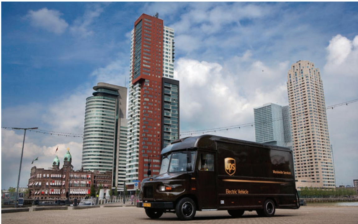
By 2022, 1,500 UPS trucks will operate on electricity, which is 66 percent of the fleet.

In addition, a recent public-private partnership between UPS and the New York State Energy Research and Development Authority to convert vehicles from diesel to