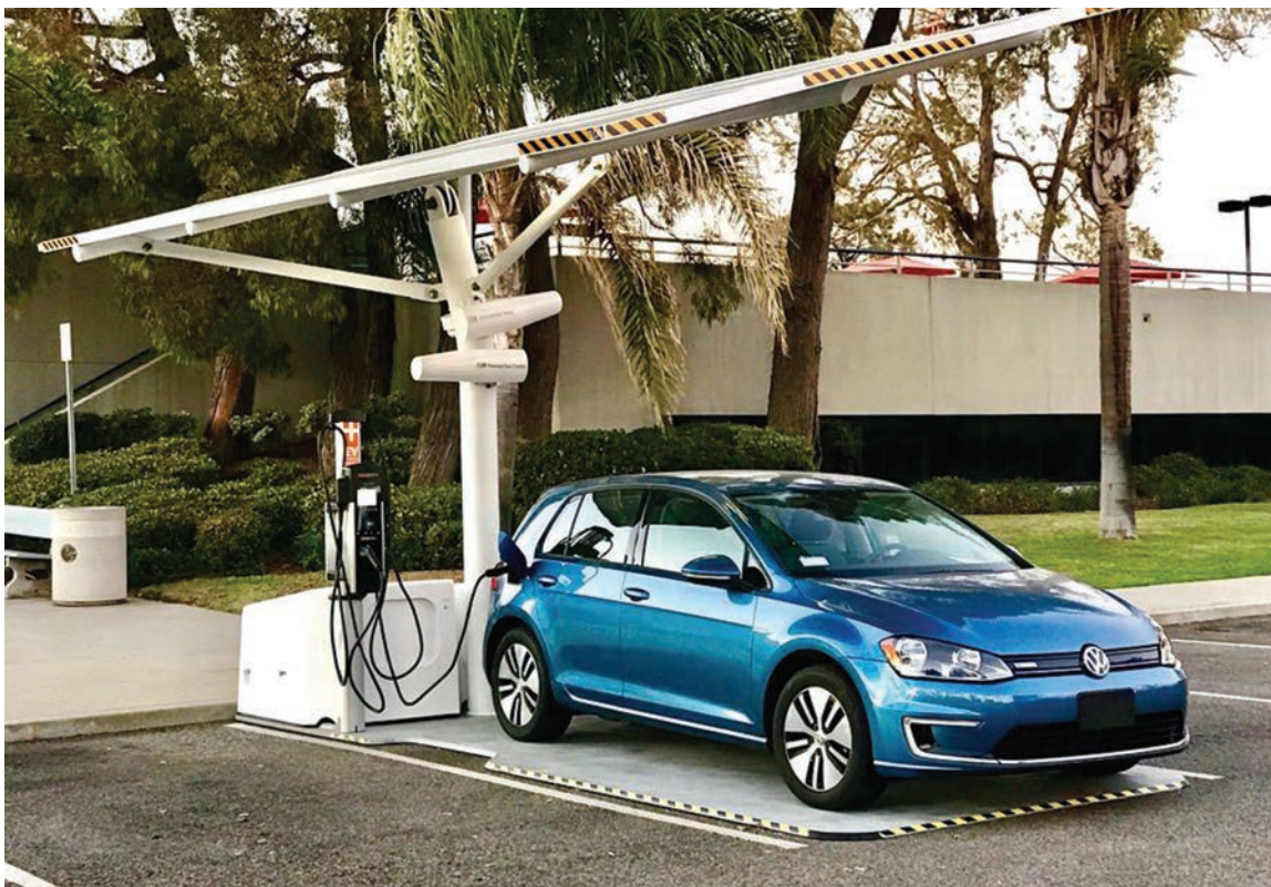
Envision Solar's EV ARC™ operates on or off the grid with solar power and energy storage.

Another way to provide backup infrastructure for charging EVs when power becomes unavailable is by deploying energy sources disconnected from the grid, such as Envision Solar International's EV ARC™ which utilizes solar energy and storage to charge EVs. New