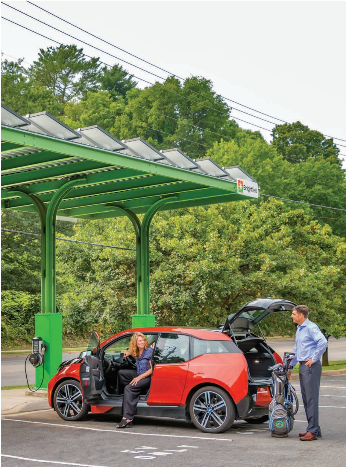
The T3 Brightfield® grid-connected Solar Driven® charging station has 18.2 kilowatts of solar-generating capacity.