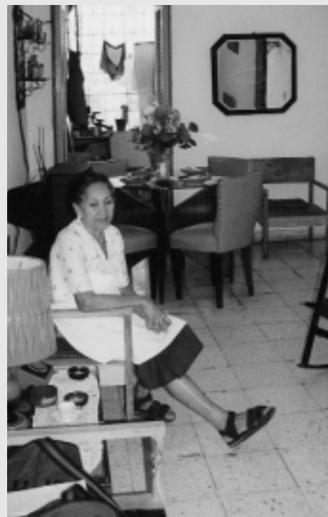
Renovated housing on the Plaza Vieja in the building shared with OHC offices.