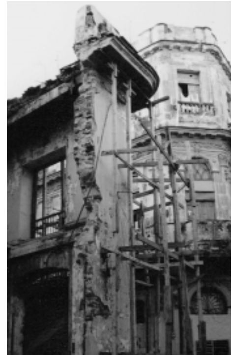
One of many collapsed buildings in Old Havana.

Judging from the limited discussion of the issue, it seems unlikely that Cuba’s central government will soon devolve fiscal and other authorities to additional local entities. But as that and other debates proceed, visitors will continue to return to Havana to see skillful Cuban workers combining tourism earnings and hard human effort to save the memory and relics of their nation’s past.