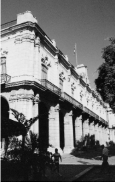
The Palacio de los Capitanes Generales on the Plaza de Armas.

One of these mayors and his municipal government staff were housed in the Palacio, its large salons partitioned into small offices, when Eusebio Leal decided to attempt its restoration. “I convinced them to move out, and finally they did,” he said, and there followed 11 years of work to convert the Palacio to the Museum of the City of Havana, which opened in 1968 and gradually expanded as restoration was completed.