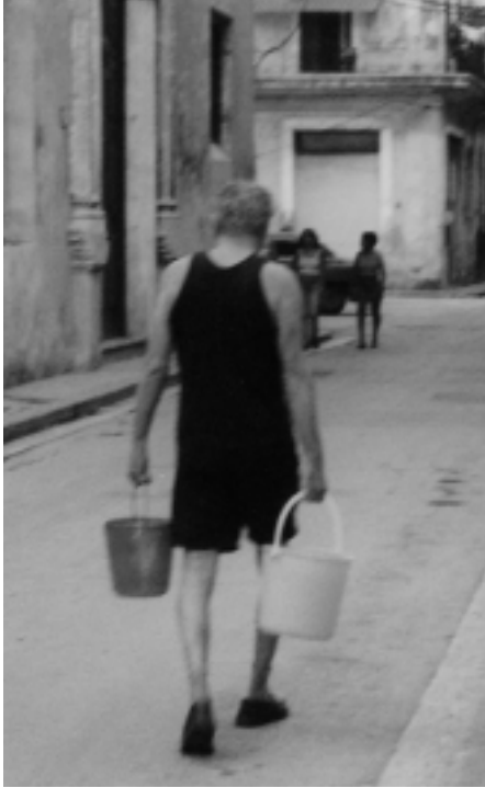
A 1996 survey found that 30% of Old Havana residents carry water into their homes every day.

Puerto Carenas , a construction company created in 1997, with 1,200 workers who build and restore historic buildings and monuments.