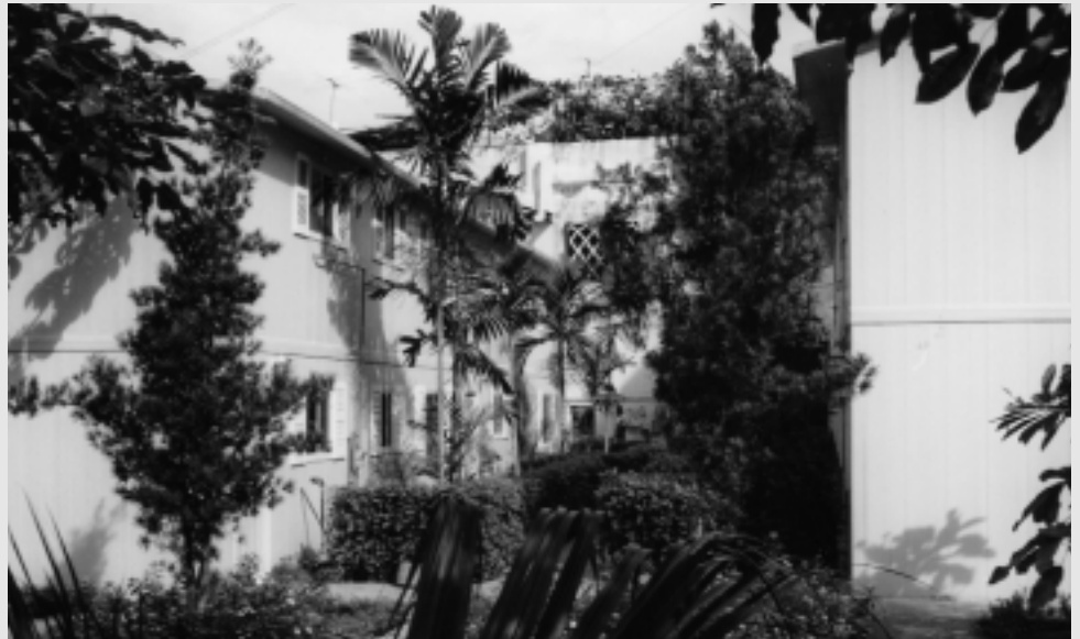
Just off the Plaza Vieja is transitional housing – prefabricated 2-bedroom apartments where residents wait for their homes to be completed. A 50-year-old woman who has lived there for one year applauds the restoration work: "It's good, and it's very ambitious – they are planning to go all the way through San Isidro." A man who lives there with his wife and two children is also pleased that he will continue to live in Old Havana: "I love it here. I grew up here, it is centrally located and I don't want to leave. But some who go to Alamar [apartment blocks east of Havana] say it's luxurious, they have houses with new flooring, glass windows, it's breezy and ventilated and cooler. And they are not living 8 to a room – people have their own rooms."