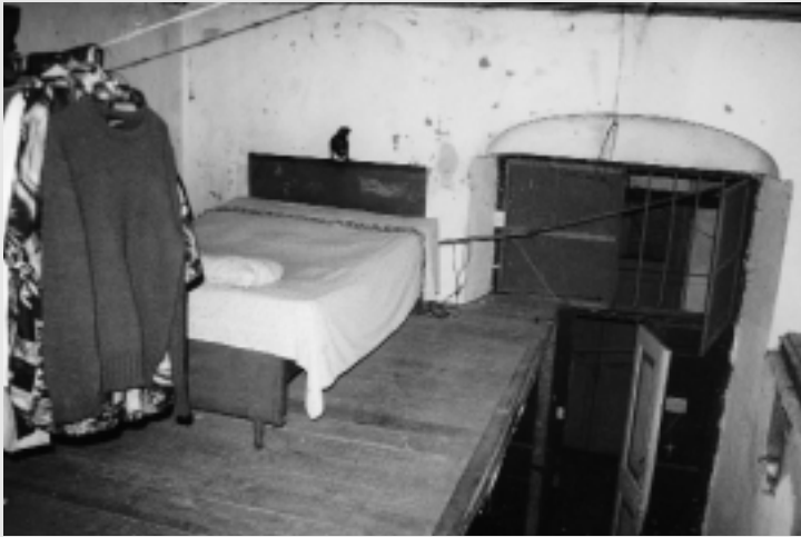
A barbacoa built in a 15 foot by 15 foot apartment with a 15 foot ceiling, shared by a mother and son.