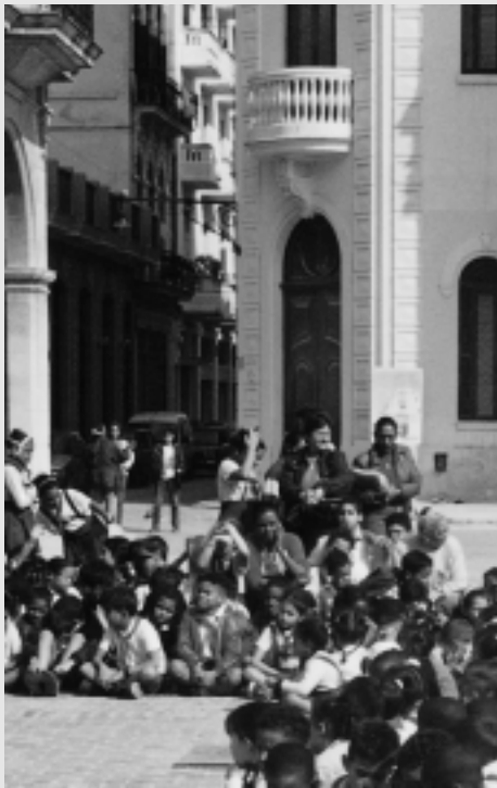
Children from local elementary schools converged on the plaza to see actors perform skits and quizzes on Cuban history. Behind them, the Gomez Vila building, built in 1909 and used as a post office, now being renovated as an apartment building for rental in dollars to foreign residents, managed by the OHC corporation Fenix.