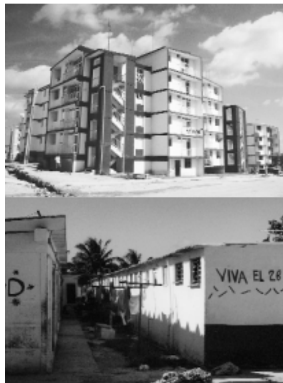
Relocated residents of Old Havana are in newly built housing in Alamar, a vast apartment complex overlooking the sea east of Havana. Lower photo: Before major restoration efforts began, other residents were relocated to small single-story apartments just across Havana Bay.

Three residents, all workers in an auto shop, described the changes on their block. Five of 12 houses had been repaired with OHC aid; one had the entire original roof in his 18th century house replaced because it was leaking and in danger of collapse. Another said his house has not been repaired, but he is beginning to take advantage of inexpensive materials that OHC makes available for do-it-yourself jobs. A bathroom sink that costs $80 in a state dollar store was provided to him for 130 pesos, the equivalent of $6.50. They said that OHC personnel hold meetings several times each year to consult residents about OHC projects and their prospects for participating in them. One also noted that Eusebio Leal, "an honest man," holds walk-in office hours once a month for neighborhood residents.