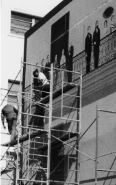
The finishing touches are put on a mural on O'Reilly street, commissioned by the Office of the Historian to decorate the blank back wall of an auto repair shop. Cuban artists worked 2 years on the project, which illustrates 67 figures from Cuban history using a medium of colored crushed stones coated in acrylic resin.