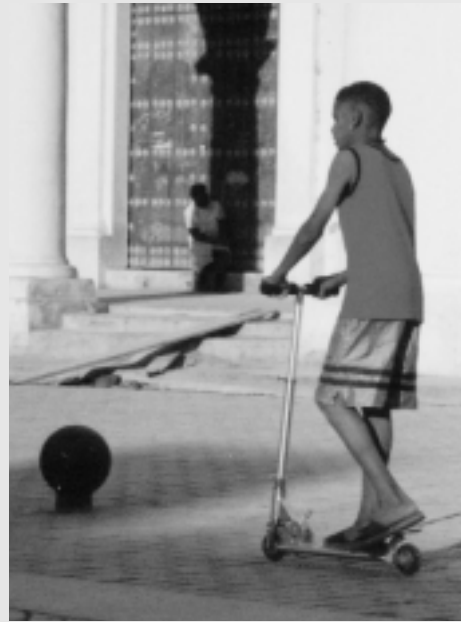
Navigating the Plaza Vieja's restored square on a scooter.