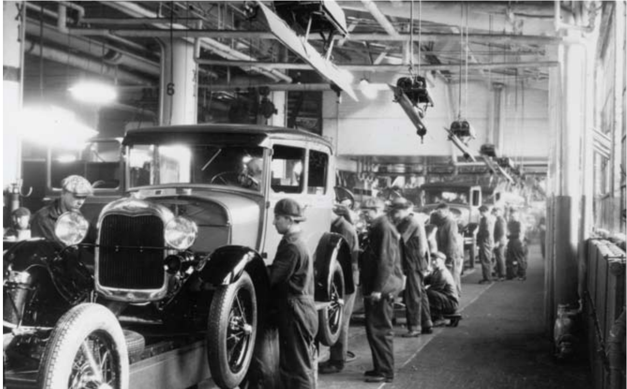
A Ford assembly line in 1928. America once led the world in automobile manufacturing, but 80 years after this picture was taken the industry nearly collapsed due to poor management and a weak economy.