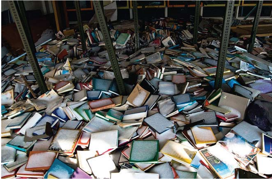
Snow covers books in an abandoned and vandalized Detroit public school. The decline of manufacturing in places like Detroit has been accompanied by rampant crime and social decay.

countries supplying said goods might oppose U.S. diplomatic or military goals, creating the danger that access to vital items could be used for political leverage by foreign governments or even cut off in a national emergency.