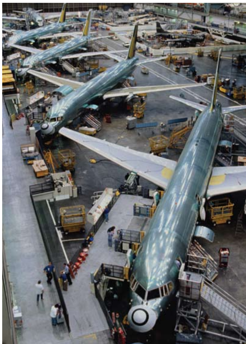
A Boeing assembly line. Aerospace is one of the few high-tech areas where America is still a global leader in manufacturing.

However, the first decade of the new millennium presented a starkly different situation. It began with a stock market sell-off as the dot.com boom went bust, and that was followed by the shock of terrorist attacks on 9-11. The administration of George W. Bush cut interest rates and taxes in an effort to revive the economy while greatly increasing defense outlays to conduct a “global war on terror.” This combination of policies initially seemed to have a strong stimulative effect on economic activity, but after a few years of moderate growth the economy weakened again in response to the sub-prime mortgage crisis. By the time Bush left office, the trade deficit had doubled to nearly $800 billion annually, the national debt had doubled to over $10 trillion, and the manufacturing sector was in rapid decline. Against this backdrop, the nation elected a new president more inclined to use the power of government to reshape the economy. As President Obama’s budget message to Congress put it, “Investing in the future has been critical to long-term economic growth and creating high-paying jobs for our people throughout our history.” Obama left little doubt that while he was in the White House, government would take a leading role in making such investments.