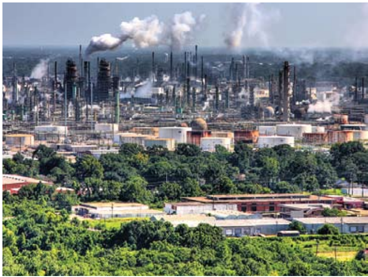
An oil refinery in Baton Rouge, Louisiana. No new refineries have been built in the United States in the last 30 years.