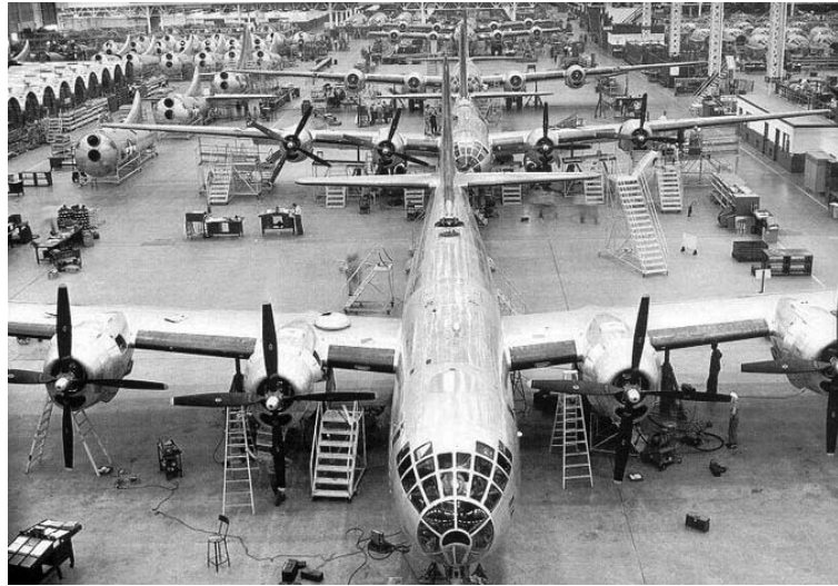
A B-29 bomber plant during World War Two. Much of the weapons production during the war was carried out in converted commercial plants.

Military spending has a major impact on industrial innovation and investment in the United States. The U.S. accounts for nearly half of all global defense outlays -- $700 billion out of $1.5 trillion -- and much of that money is spent on developing, manufacturing and maintaining military equipment. The Obama Administration's first defense budget proposed allocating $210 billion to the purchase of new equipment in fiscal 2010, with many additional billions set aside for the maintenance and modification of equipment already in the force. Further equipment outlays were contained in the budget requests for the Department of Homeland Security (which manages the Coast Guard) and the Department of Energy (which manages nuclear weapons programs). When all of the administration's proposed security expenditures with potential to generate industrial demand are added together, they total over a quarter of a trillion dollars per year.