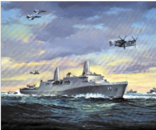
Future expeditionary warfare will be conducted by a comprehensively networked force effective in every medium, from beneath the seas to orbits in space.

Marines will continue to build on the experience of these two recent combat operations with near-term exercises and experiments. Acting on an innovation employed during Enduring Freedom, now codified in Sea Power 21 , the Pacific Fleet will deploy a new "expeditionary strike group" (ESG) on a pilot basis later in 2003. This will be followed by an Atlantic Fleet deployment in 2004. The ESG adds strike-capable surface warships and submarines to existing ARGs and MEUs to provide a more integrated and powerful Navy/Marine operating group. Once fully implemented, the ESG will effectively double the number of independent operating groups the Navy can deploy, when combined with existing carrier battle groups and the missile-defense surface action groups which are built around cruisers.