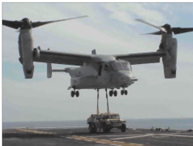
The V-22 Osprey can lift artillery and vehicles over considerable distances, such as the Humvee pictured above.

Maneuver Warfare. The “philosophical basis” of EMW , maneuver warfare is all about rapidly achieving the advantage, in both time and space, over the adversary. In Joint Vision 2020 , “dominant maneuver” is defined as “the ability of joint forces to gain positional advantage with decisive speed and overwhelming operational tempo.” This is the essence of maneuver warfare, using our strength against identified enemy weaknesses. Successful execution requires capabilities Marines consider among their core competencies — dynamic, decentralized decision-making; aggressive action-oriented culture; and, fully integrated combined-arms capability. This is as much a matter of training and education as hardware. It was these qualities which allowed the 1st Marine Expeditionary Force to move into Iraq two days ahead of schedule with four hours warning and enter central Baghdad 20 days later during Operation Iraqi Freedom.