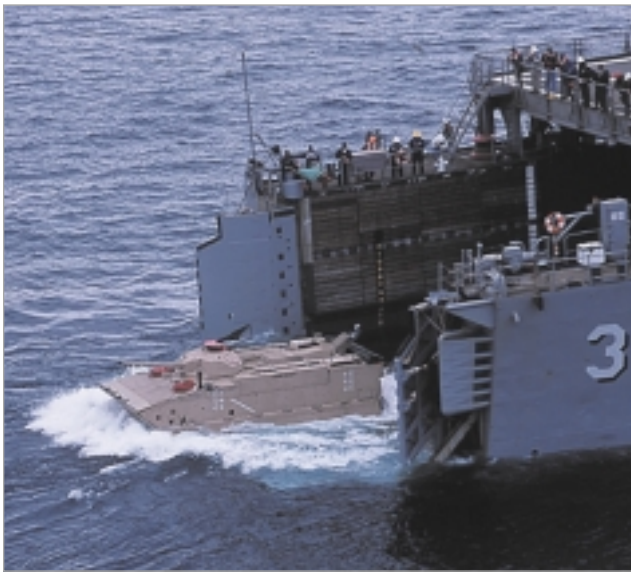
The Advanced Amphibious Assault Vehicle will make coastal waters a maneuver space in littoral combat.

Mobility and Agility. The “mobility triad” of systems is central to expeditionary maneuver. Of the three systems, two — AAV and MV-22 — are just now on the verge of full scale production, and incorporate revolutionary technologies. The third, the LCAC, entered service in 1984. An LCAC service-life extension program began in 2001, and will continue at the rate of four-six per year until 73 craft are updated with service lives extended 10 years beyond the planned 20. With its air cushion technology, the LCAC is able to deliver personnel, supplies and heavy equipment over 70% of the world’s shoreline.