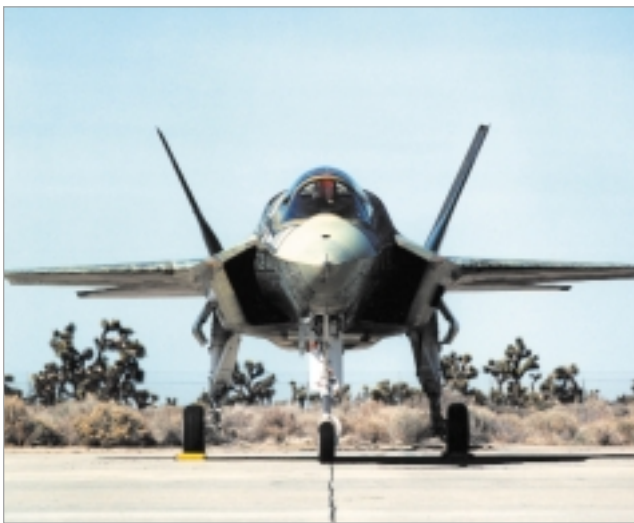
A combination of stealth, advanced electronics, and high-speed agility will make F-35B the most survivable aircraft the Marine Corps has ever fielded.

One of the defining characteristics of the decade since the end of the Cold War has been the rapid advance of U.S. military technology, giving U.S. forces a capability far beyond that of any potential adversary — and indeed, most allies.