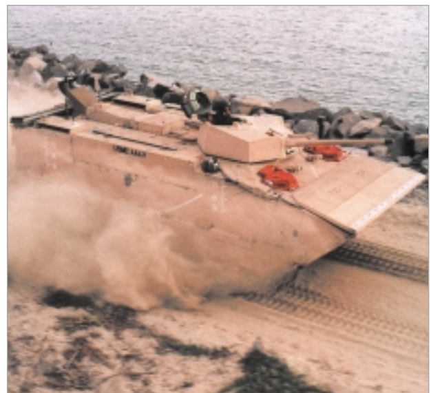
The Advanced Amphibious Assault Vehicle will be far faster, more flexible and more versatile than the vehicles it replaces.

Prepositioning and Lift. Amphibious lift is provided by the Navy and funded in the shipbuilding account. This fleet is organized into Amphibious Ready Groups (ARGs), each with three ships. Despite a validated warfighting requirement for 14 ARGs, the current program allows for 12 ARGs — an objective that will not be fully met until 2014. In support of this goal, the Navy has one class currently under construction (LHD); one in the last stages of development (LPD-17); and one in the concept definition phase (LHA-R). The LHD — and its predecessor the LHA — amphibious assault ships are the centerpiece of the ARG. The last of the current Wasp-class LHD's is now under construction, leaving four older LHAs that will have to be replaced by a follow-on ship beginning early in the next decade. Although the first of those follow-on ships has been defined and is scheduled for a contract award in FY2007, the remaining ships are on an extended development, procurement and construction schedule that will stretch replacement out at least seven years past the planned retirement of the last LHA.