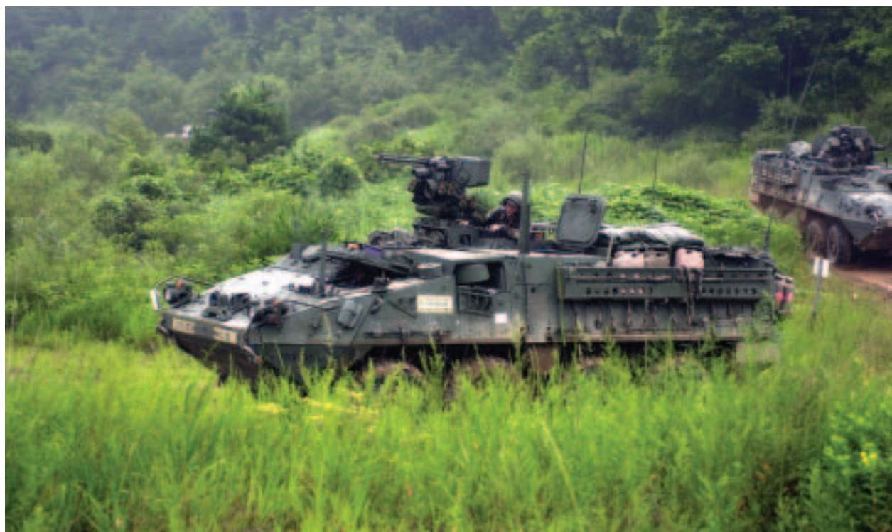
Stryker ICV in the field.

The capabilities of the wheeled combat vehicle answered the requirement to make the force lighter and thus more strategically and tactically mobile. The selection of the Swiss designed Piranha 8X8 wheeled combat vehicle for the Army’s Stryker Brigade Combat Teams (BCTs) is leading the effort. The Stryker comes in two variants: the Infantry Carrier Vehicle (ICV) and the Mobile Gun System (MGS). The ICV has been further adapted as a mortar carrier; an anti-tank guided missile (TOW) vehicle; a nuclear, chemical and biological reconnaissance vehicle; a medical vehicle; an engineer vehicle; and a command vehicle. The longer cruising range (330 miles on 53 gallons) and parts commonality will ease the logistical and maintenance burden for the BCTs. The Strykers have tires that can run either inflated or deflated to make it safer and easier to traverse surfaces ranging from deep mud to hardtop, and can run on flat tires.