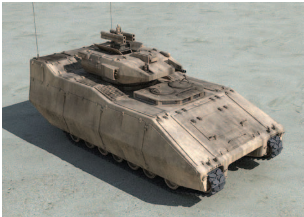
Concept for an FCS IFV.

The FCS is being designed for a reduced logistical footprint. Fuel consumption will be considerably less per vehicle than current combat vehicles and the engine systems are being designed to produce water for the crew and accompanying personnel, further reducing the logistical requirements. Sensors will warn of vehicle problems and parts commonality